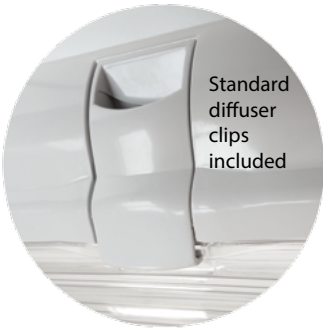
Standard diffuser clips included