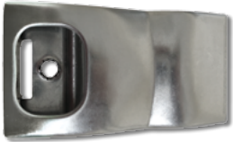
Stainless steel clips available