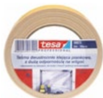
TESA adhesive tape