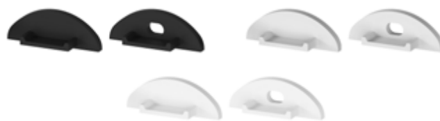
plastic end caps P2-1+C1/C4